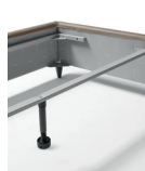
BAR FOR SINGLE BED FRAMES